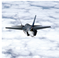
DEFENSE LOGISTICS & COMPLIANCE