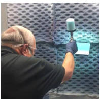
INTERMIX PAINT SERVICES