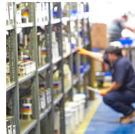
VENDOR MANAGED INVENTORY